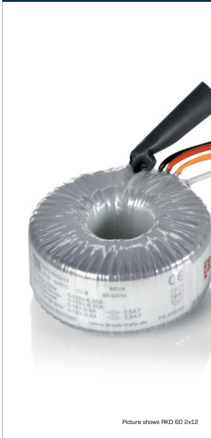
Picture shows RKD 60 2x12